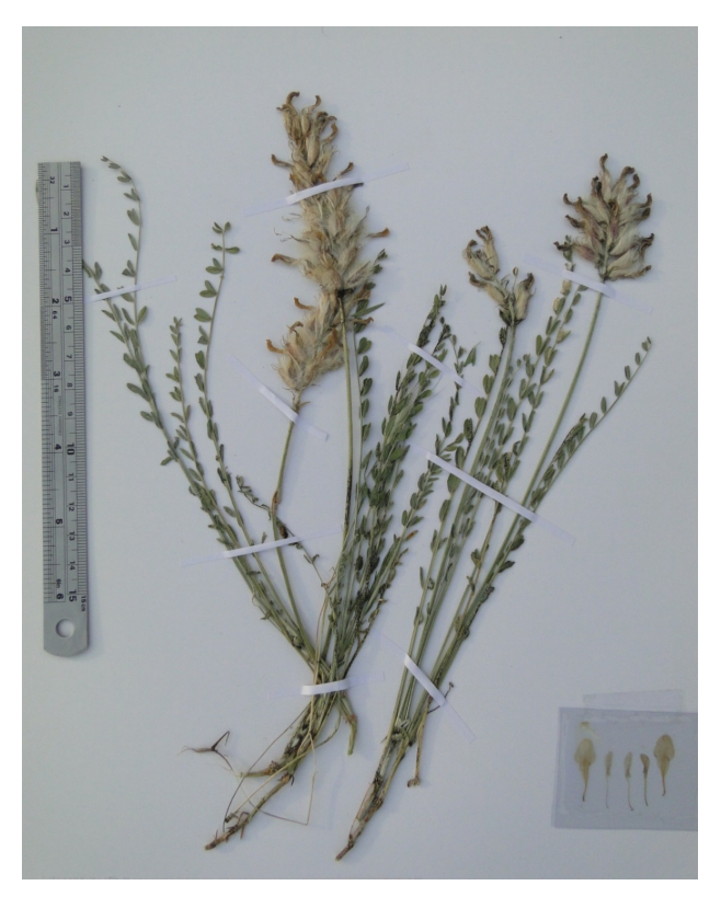
Fig. 4. Holotype of Astragalus subaspadanus (after A. Bagheri 32).