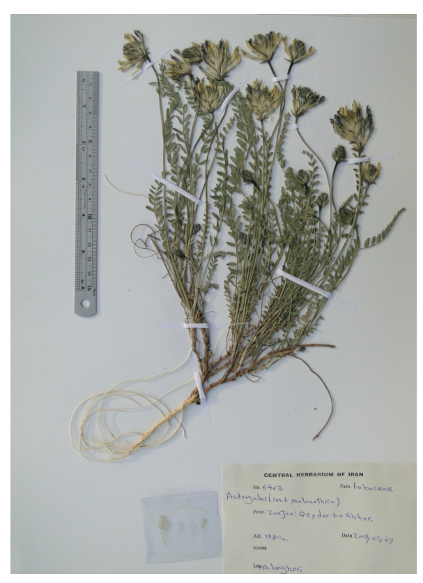
Fig. 2. Astragalus neo-iranshahri: Habit.