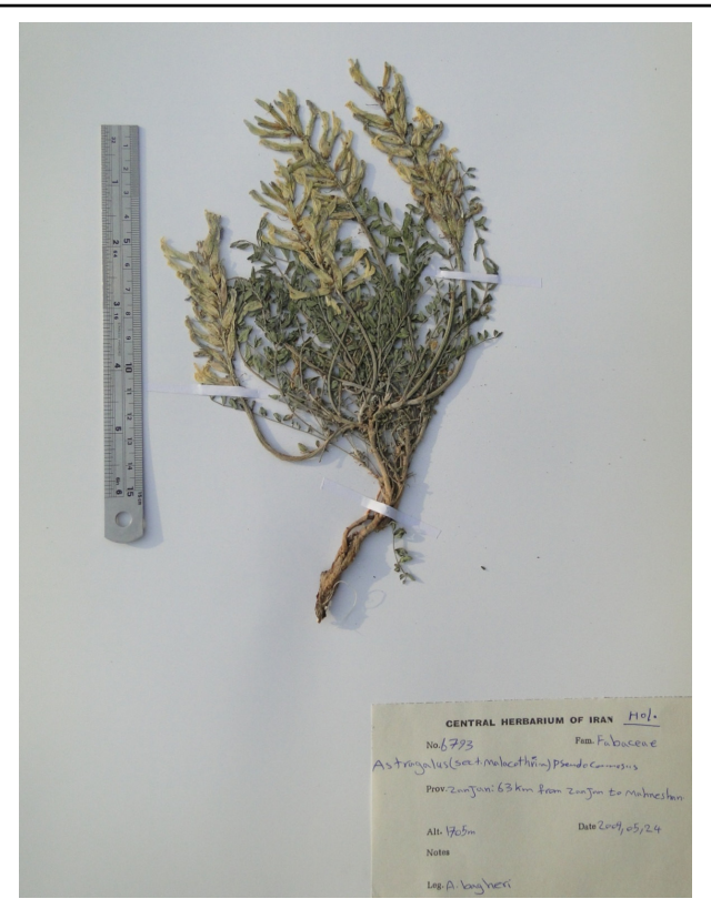
Fig. 3. Holotype of Astragalus pseudocomosus (after A. Bagheri 6793).