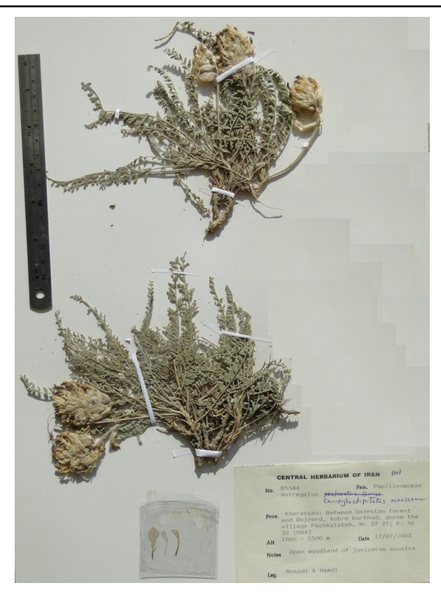
Fig. 1. Astragalus musaianus: Habit.